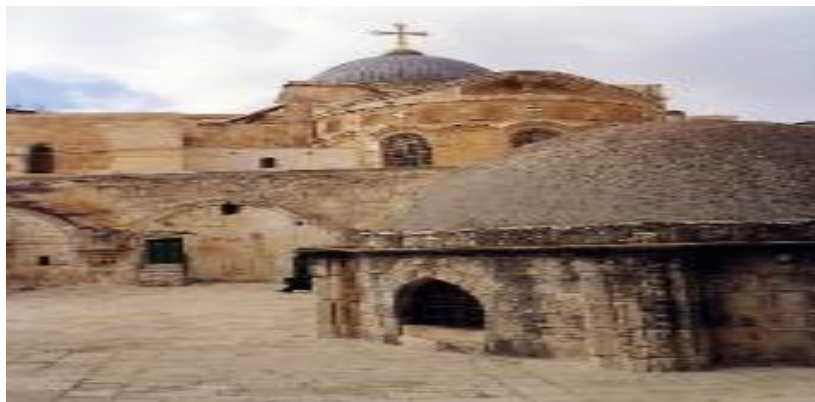
The Church of the Holy Sepulchre today.

But remember that Jesus suffered and died in Jerusalem, a territory of the Roman Empire, and hostile to Christians. It was not until the 4 th Century and the reign of the Christian Emperor Constantine that Christians began flocking to the Holy Land to visit these sites on the Via Crucis (Way of the Cross). During Holy Week, and specifically Holy Thursday, they would process from the Garden of Gethsemane to Church of the Holy Sepulchre, a structure erected by Constantine in 335 atop Calvary and the tomb of Jesus.