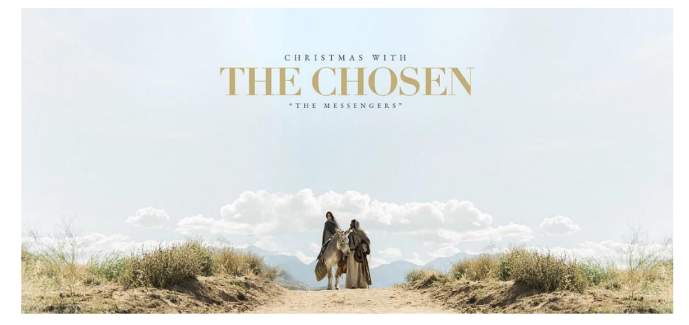
"Christmas With the Chosen: The Messengers" is a direct-to-theater episode shot entirely in secret and will have a 10-day run.